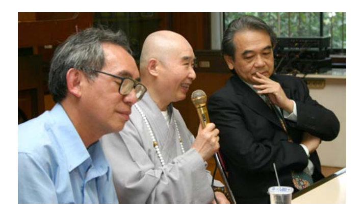
21st Feb: Visiting Islamic University

tions on the topics related to modern Indonesian society. Master explained that only by practice Godils love with our sincere mind and use our own words and deeds to realize his teaching, could we hope to resolve numerous misunderstanding and conflicts.